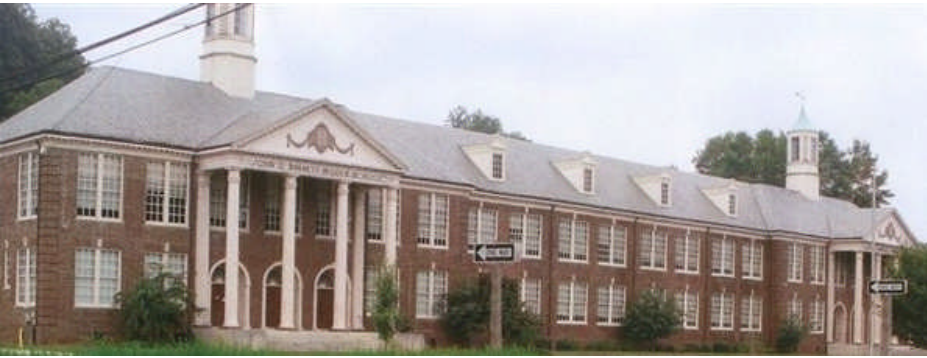
Historic J. D. Bassett High School (HJDB)