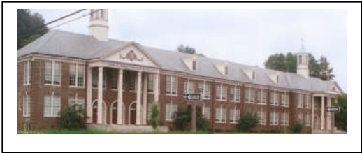
Dancing in the street